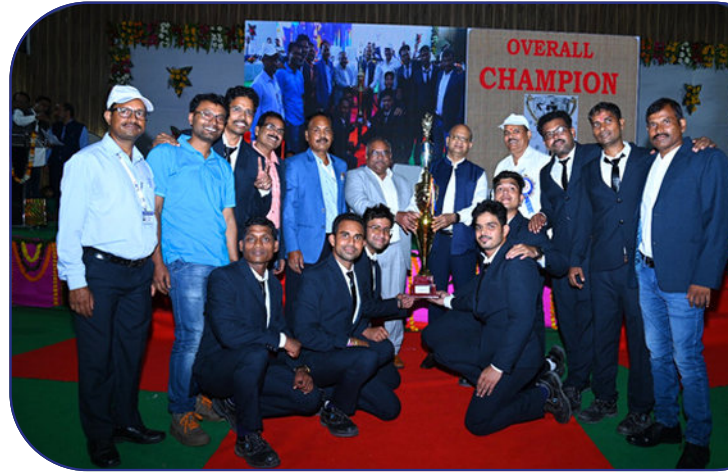
The overall champions Ib valley team with winning trophy.